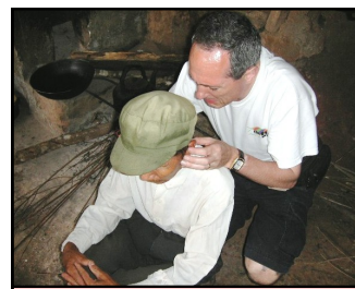
This man in a Deang tribal village was deaf until hands were laid on him for healing in the Name of Jesus. Now he hears perfectly!

On every healing outreach, team members see many miracle healings, plus many saved. You will, too!