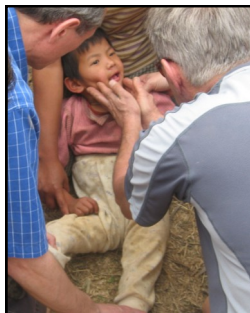
This 4 year old girl in a Jingpo tribal village had never walked nor spoken, but after prayer, she began to walk and spoke her first words!

Note: Those we do not know may be asked for a letter of recommendation from their pastor.