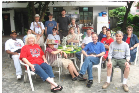
Ambassador Ministries China Outreach Team, March 2007

Our experience has shown that as we fulfill this objective in the power of the Holy Ghost, new villages are rapidly evangelized, the church is enlarged and strengthened, and those who participate are forever changed!